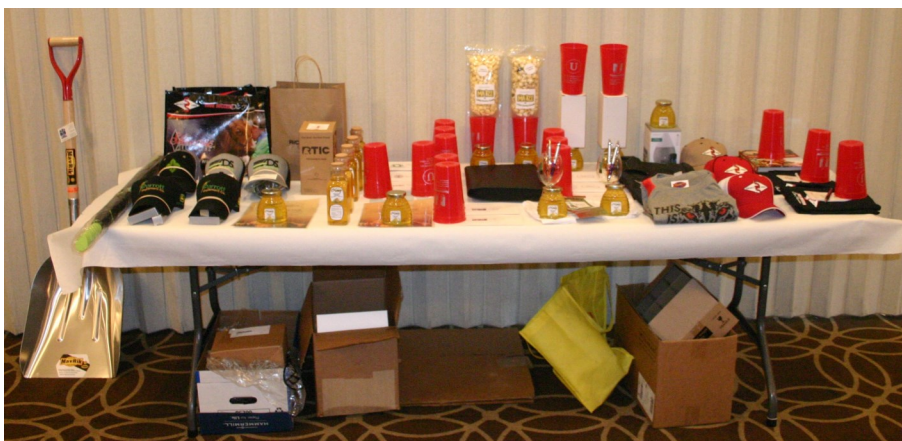
(Above generous door prizes we received from local businesses)

Lucas and Lyndsay Braun were recognized as the 2019 Union SWCD Cooperator of the Year. The Union Soil & Water Conservation District annually spotlights one Union County Cooperator for their outstanding contributions in advancing conservation locally. The Braun's used the Conservation Reserve Program to assist with the installation of a wetland and implementation of a wildlife focused conversion of old farm fields to native friendly habitat.